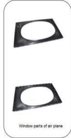
Window parts of air plane