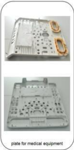
plate for medical equipment